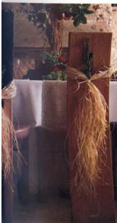
Table Setting and Yorkshire grown flowers by Ambience Chair Cover Hire