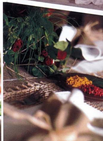
Table Setting by Ambience Chair Cover Hire and Yorkshire grown flowers by Snezana Frzina