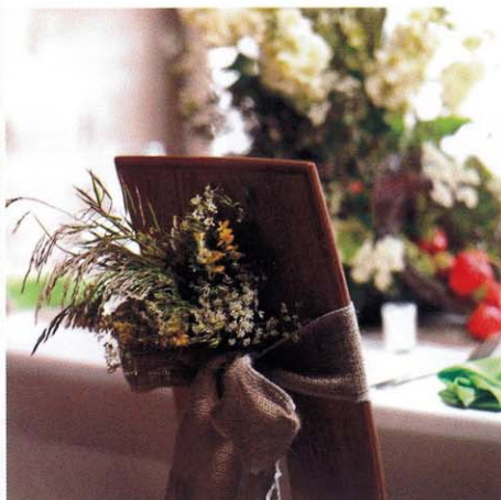
Table Setting and Yorkshire grown flowers by Ambience Chair Cover Hire